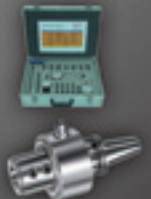
Coolant pressure gauging-kit Rotating coolant connector